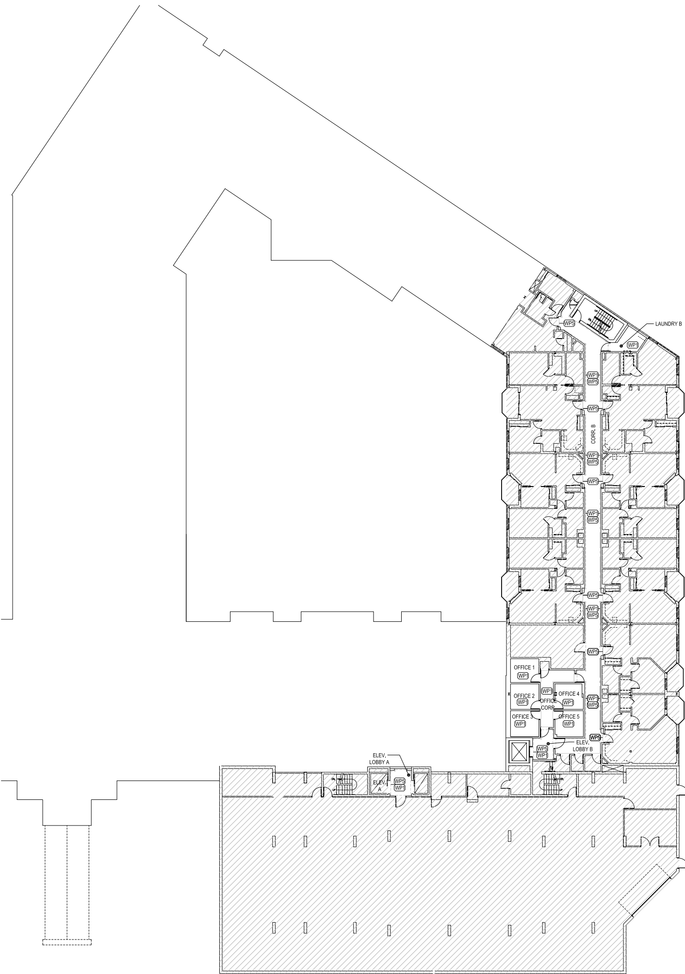
1 MEZZANINE - WALL FINISH PLAN SCALE: 1/16" = 1'-0"

Phase K.I.D. Proj. No. 1405.00 DATE: 09.03.2014 SCALE: 1/16" = 1'-0"